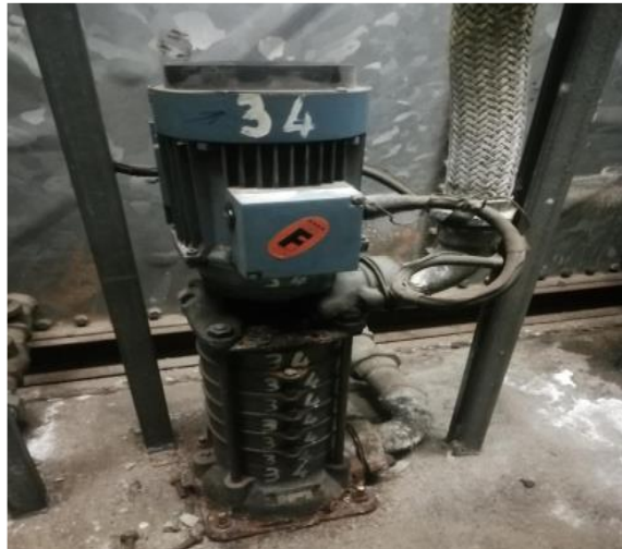
B BLOCK PUMP